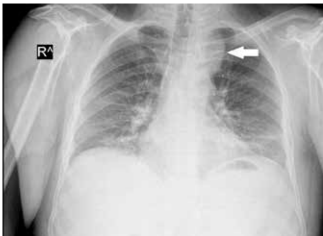
Figure 1. Posteroanterior chest X-Ray showing a left posterior lung field mass protruding from the mediastinum (White Arrow).

A 35-year-old male was admitted to the Emergency Department with chest pain and hoarseness lasting for a month. The patient's history was not consequential. No considerable abnormalities, including those in carcinoembryonic antigen and \alpha -fetoprotein levels, were not revealed in the physical examination and laboratory test results. A well-defined mass located in the left posterior lung field, bulging out of the mediastinum was exhibited in the chest roentgenogram (Figure 1). A clearly demarcated, encircled mass, ~58x36x34 mm in size, in the left posterior mediastinum with the cervical extension was found in the contrast-enhanced computed tomography of the chest (Figure 2A, B and C). Positron emission tomography was not performed because the patient is not considered to have a malignant tumor.