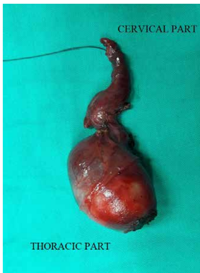
Figure 3. Postoperative view of the schwannoma showing the tumor originating from, and encasing the vagus nerve.

The patient went through the left-sided video-assisted thoracoscopic surgery (VATS). During the surgery, a large tumor with a round shape was detected in the left posterior mediastinum. A tumor stemmed from the vagus nerve and encased it (Figure 3). The mass was standing in the anterior and superior to the aortic arch, and extended to the cervical region. It was adjacent to the left subclavian artery, left common carotid artery, and left innominate vein as it was seen in the imagings, but it was not invasive (Figure 2). The intrathoracic mass was separated from the surrounding tissues and removed easily and completely because of the intact tumor capsule except for the nervus vagus. It completely wrapped the nervus vagus and it was impossible for us to separate (Figure 3). However, a piece of the mass extended to the cervical region. A suprasternal cervical approach was employed to remove it completely. During the operation, the patient was closely observed in terms of the severe cardiac rhythm abnormalities including bradycardia and asystole.