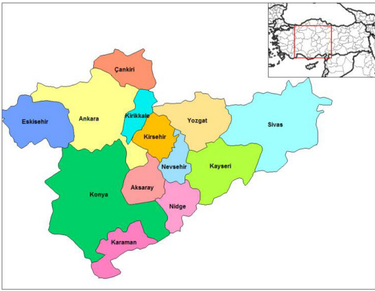
Figure 2. The illustrative map of the study area.